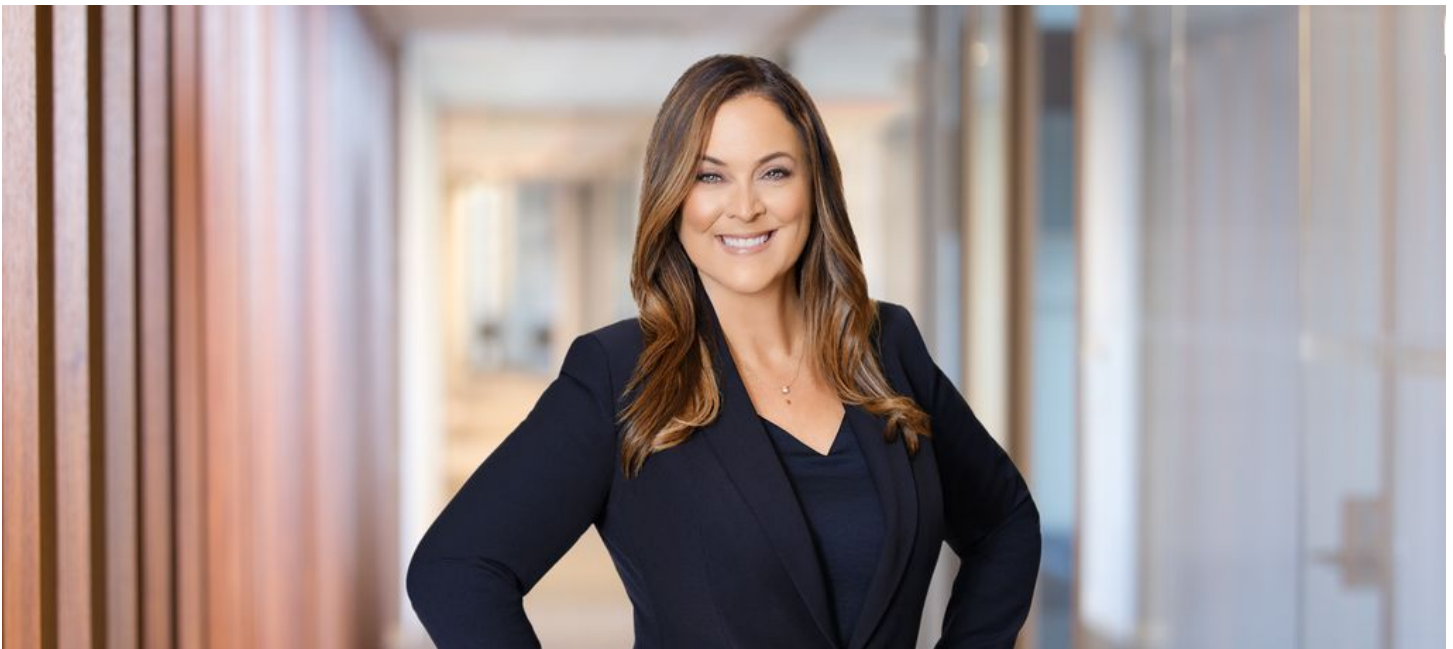
Silicon Valley Business Journal