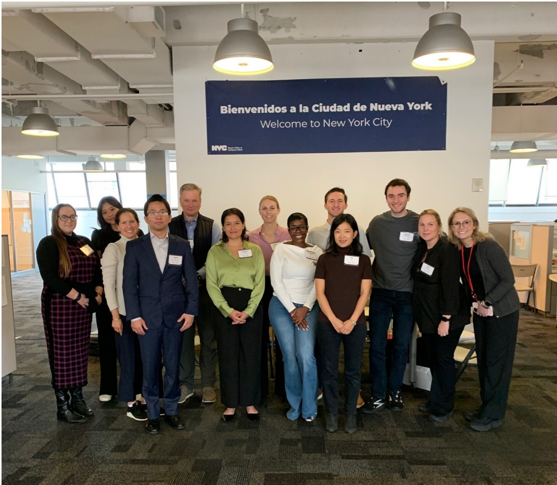
The Winston/Cisco team at the Asylum Application Help Center