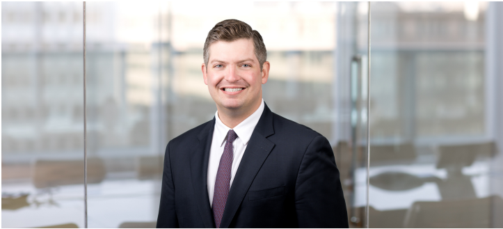
Michael J. Trucco